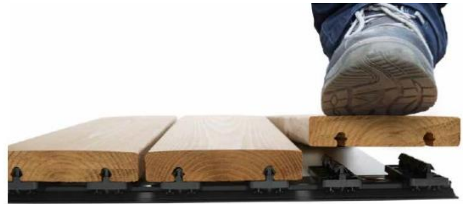
'GRAD SYSTEM' SET-UP