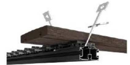
100% REMOVABLE one board at a time, thanks to specifically-designed disassembly keys