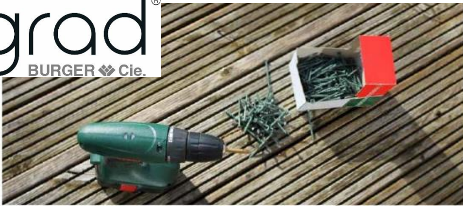
'TRADITIONAL' INSTALLATION OR WITH SIDE CLIPS